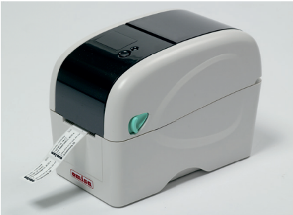
Tag printer and label tags

All components are covered by the OMISA warranty.