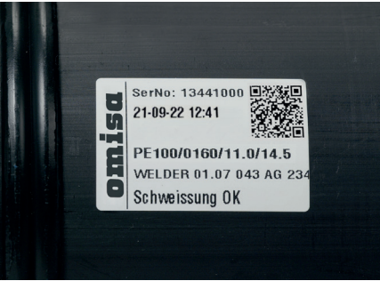
Tag printer and label tags

Immediate quality labeling of every welded joint is possible with the optional dedicated tag printer that delivers an abrasion-proof plastic sticker which can be used as a label on the fitting or joint.